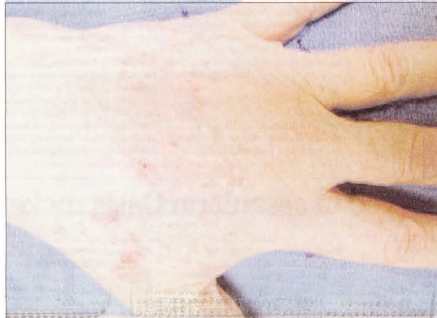
Now dermal fillers can put mass back into hands and fill in the wrinkles, making veins less prominent.