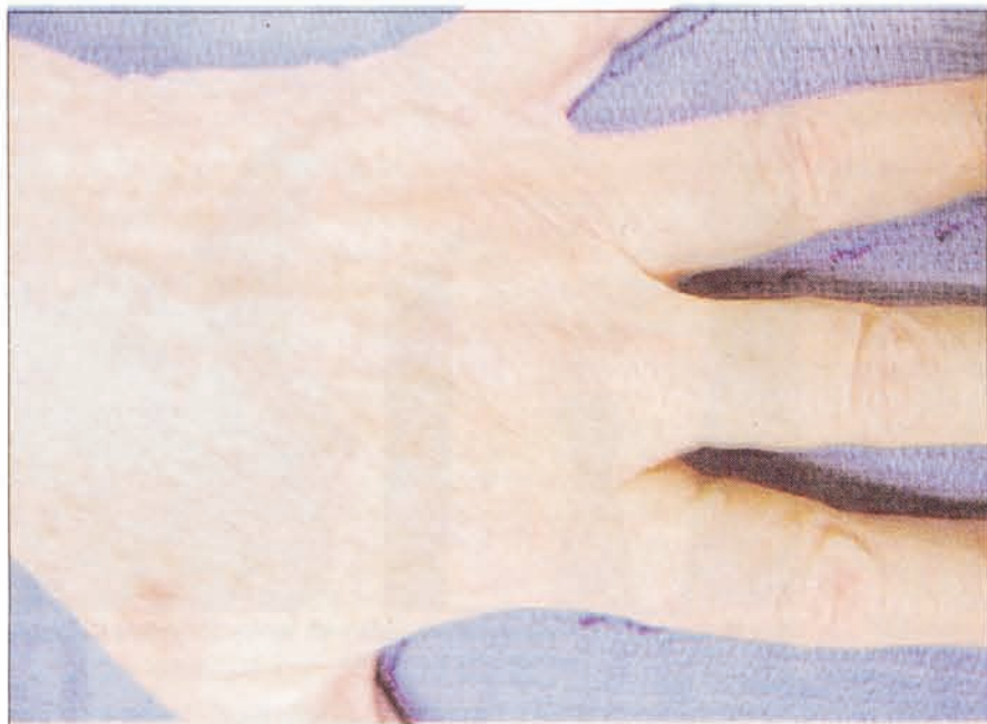
Once upon a time, hands were a dead giveaway of a woman's age.